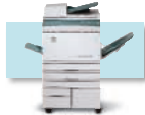
Xerox Document Centre 545 45 pages per minute (Shown with High Capacity Feeder, Duplex Automatic Document Feeder and Offsetting Catch Tray options)