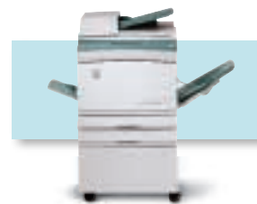
Xerox Document Centre 535 35 pages per minute (Shown with Duplex Automatic Document Feeder and Offsetting Catch Tray options)

Note: Features, configurations and options may vary by location.