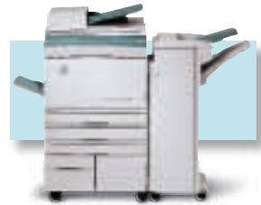
Xerox Document Centre 555 55 pages per minute (Shown with High Capacity Feeder, Duplex Automatic Document Feeder and Finisher options)

Call today. For more information, call 1-800-ASK-XEROX or visit us at www.xerox.com/500series . For detailed product specifications, contact your Xerox representative and ask for the Document Centre 555/545/535 Specification Document.